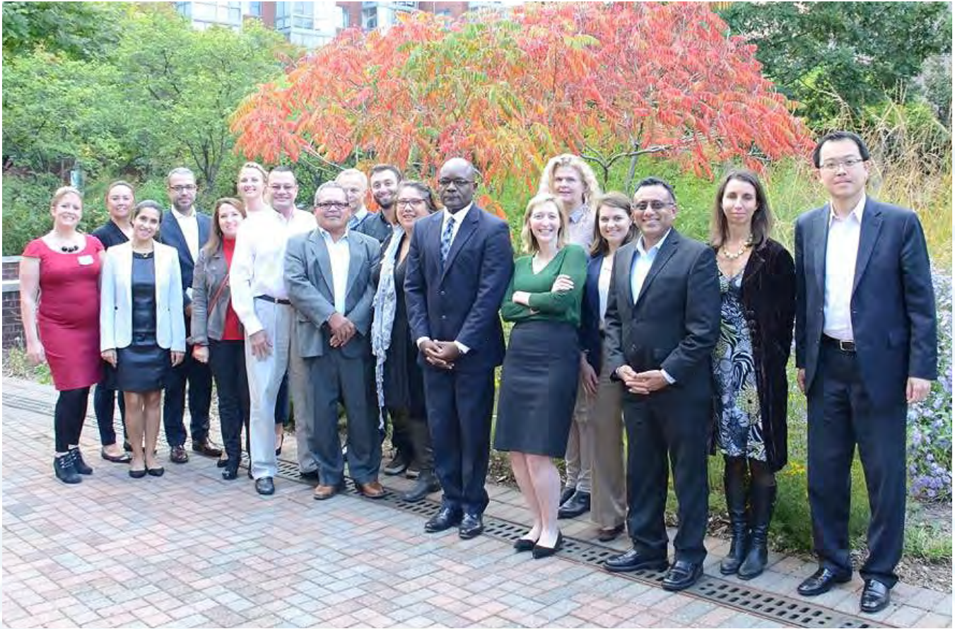
2016 Steering Committee meeting